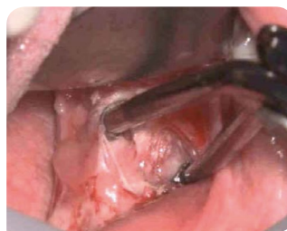
Tonsillar Dissection. Präparieren der Tonsille.

Tonsillectomies can be performed very quickly with little, but precise and effective bipolar coagulation while most of the dissection is “cold” or “blunt”. The glossopharyngeal nerve can be identified and spared. 1