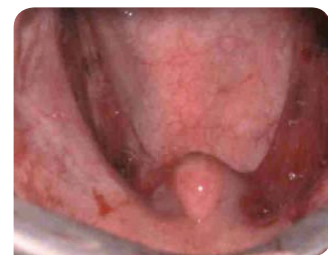
Wound immediately after tonsillectomy. Wunde unmittelbar nach der Tonsillektomie.